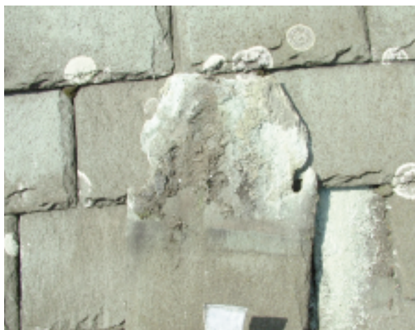
The overlapped upper areas of the Westmorland green slate have become soft and are crumbling, especially around the nail fixing points, which have disintegrated. By contrast, the exposed area of the lower half remains hard and sound, but the underside is flaking, just like the upper portion of the slate.

in many cases may be thousands of miles across the world). Also, the energy that is used to supply the slates will be compensated for over a longer period of use, making the energy consumed per year of service life less. In addition to conserving energy, it will also mean that our reserves of good quality natural slate will last longer.